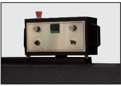
Swivel Control Panel for Dual Side Operator Access