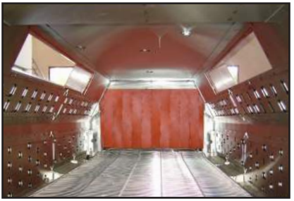
Chain Mesh Belt & Viewing Windows on Both Sides