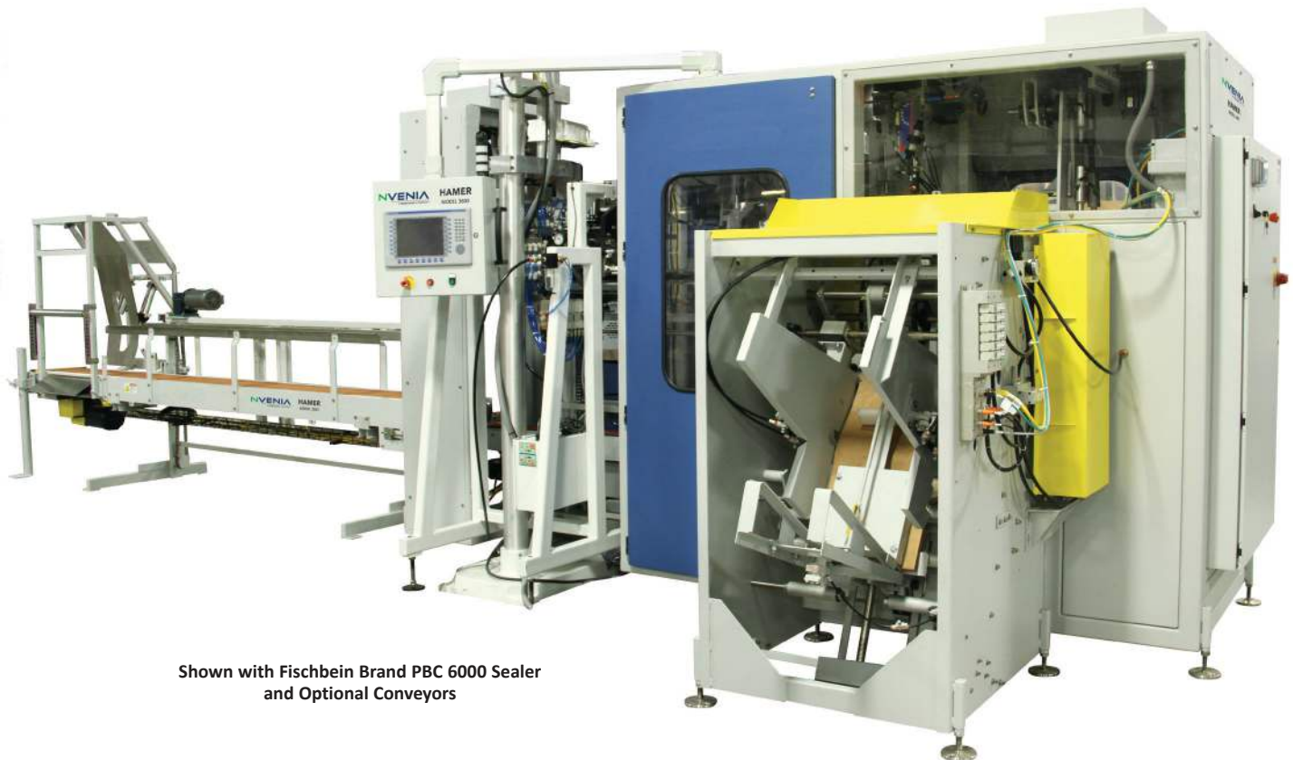
Shown with Fischbein Brand PBC 6000 Sealer and Optional Conveyors

The Model 3603 is integrated with an auger filling system and is capable of handling gusseted, multi-wall open mouth paper, and paper pinch bags.